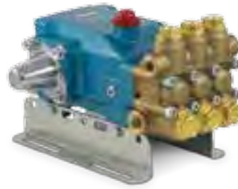
5CP3120 Solid Shaft Pump