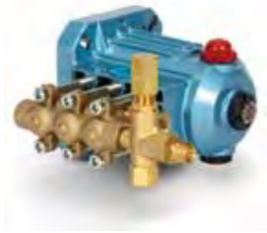
2SF10ES3 Hollow Shaft Pump