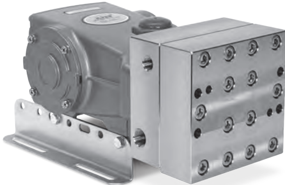
Model 781 Shown (Mounting rails sold separately)