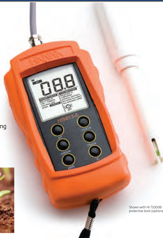
Shown with HI 710008 protective boot (optional)