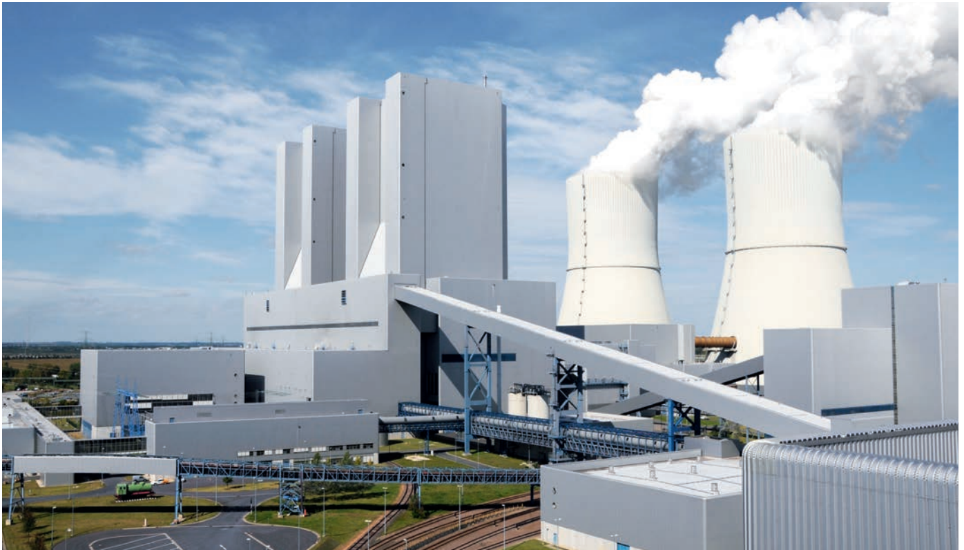
■ Reverse osmosis membrane elements from LANXESS are used to produce boiler feedwater in power stations.