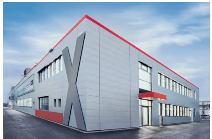
■ LANXESS produces Lewabrane® membrane elements at an ultramodern, fully automated facility in Bitterfeld, Germany.

We are your reliable, expert partner for all your water treatment needs.