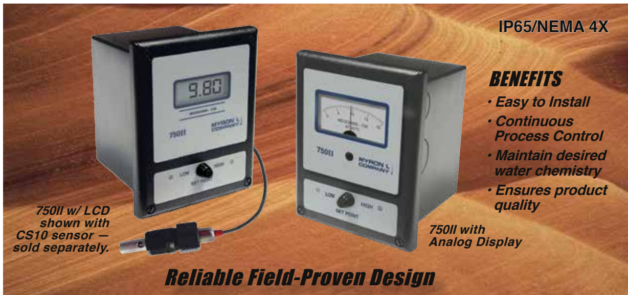
750II w/ LCD shown with CS10 sensor — sold separately.