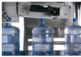
BOTTLED WATER FILL LINES