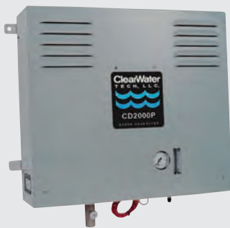
CD2000P Ozone Generator